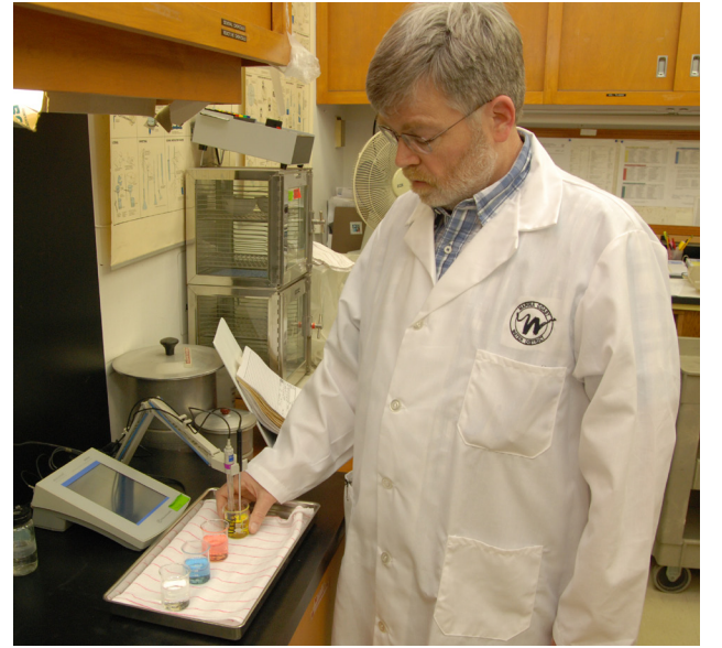
Water Quality Chemist analyzing a water sample

Prinking water, including bottled water, may reasonably be expected to contain at least small amounts of some contaminants. The presence of contaminants does not necessarily indicate that water poses a heath risk. More information about contaminants and potential health effects can be obtained by calling the USEPA's Safe Drinking Water Hotline (1-800-426-4791).