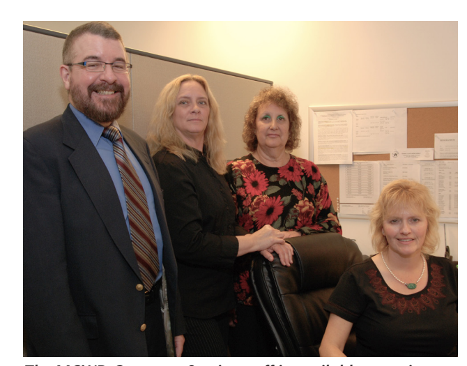
The MCWD Customer Service staff is available to assist you 8:00 a.m. to 5:30 p.m. Monday through Friday, excluding